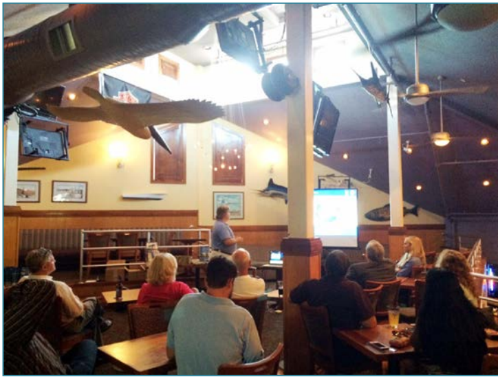
Monitor staff gave a variety of presentations on current projects to community members in Nags Head, N.C.