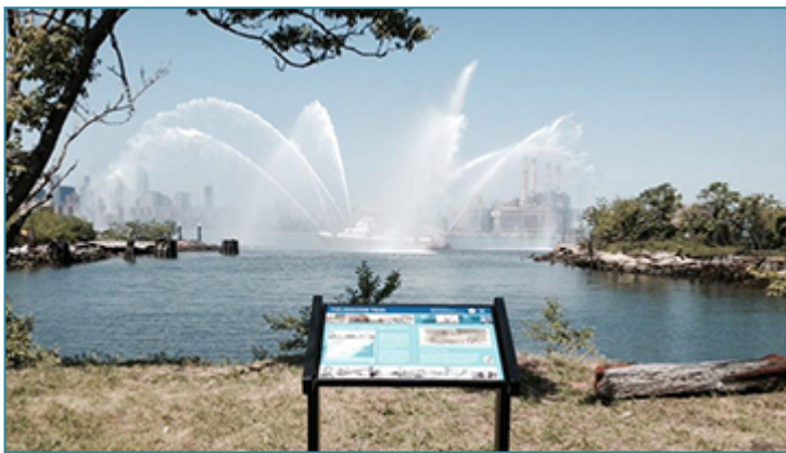
New York's fireboat 343 was onsite to help celebrate the dedication of the third Monitor Trail sign in Brooklyn, N.Y. The 343 is named in honor of the number of FDNY members killed in the line of duty on Sept. 11, 2001.