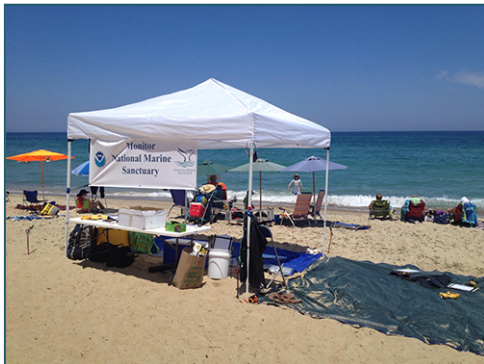
ANCHOR station for NOAA archaeologists and divers located off Second Street in Kill Devil Hills, N.C.