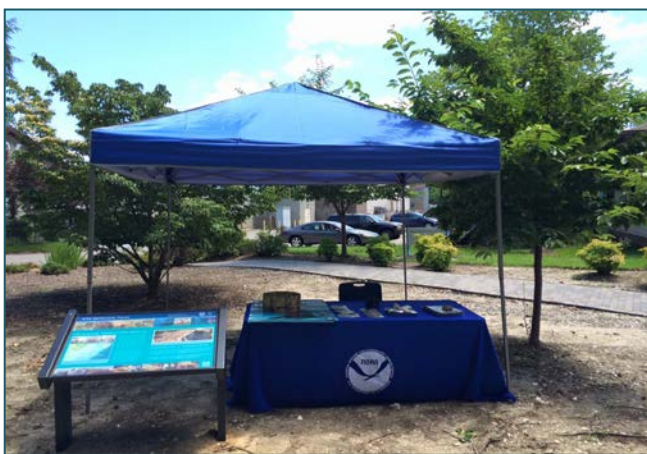
Tent set up next to the Monitor Trail wayside sign outside MNMS offices located along the Noland Trail at The Mariners' Museum in Newport News, Va.

For any questions or additional information on the ANCHOR program, please contact Kara Fox at Kara.Fox@noaa.gov .