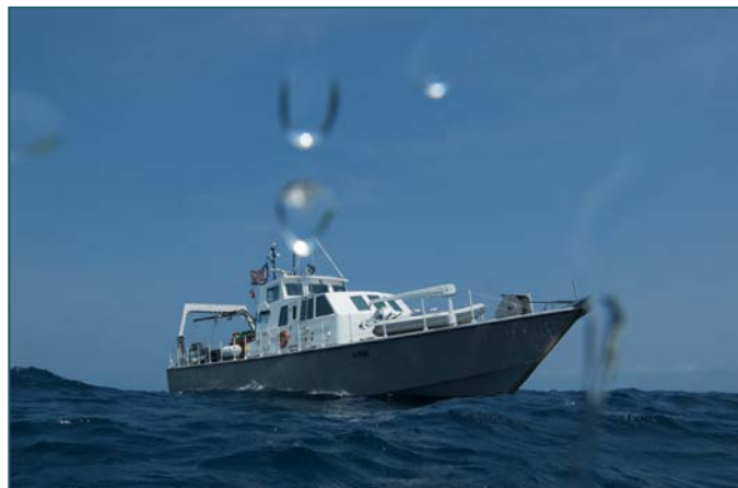
NOAA's SRVx Sand Tiger , a 90 ft. research vessel.