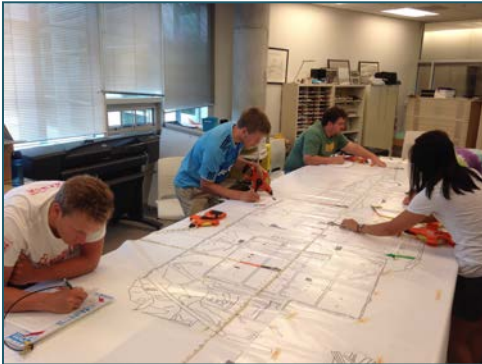
ANCHOR participants practice recording techniques on land before heading into the water.