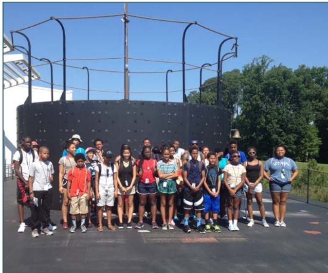
NABS YES students on the deck of USS Monitor replica at The Mariners' Museum in Newport News, Va.