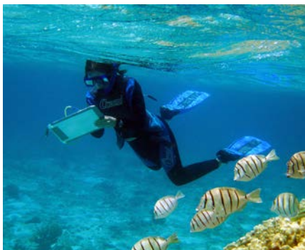
Diver conducting a fish count on a shipwreck