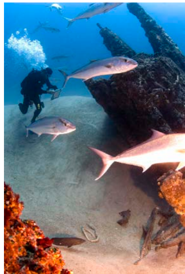
German U-boat, U-701, off the North Carolina coast

Today, the shipwreck is home to an abundance of sea life. As stewards of this national treasure, MNMS works to protect and conserve this important cultural resource and its maritime heritage. We invite students across the US, to join us in celebrating our country's rich, diverse maritime heritage by entering our One Ocean Film Festival!