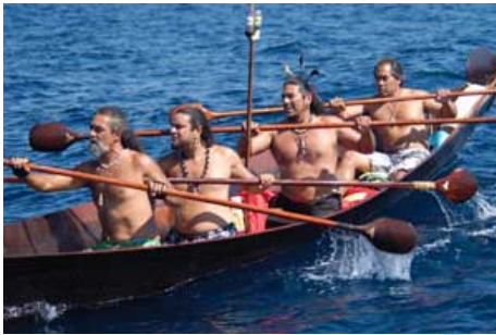
Chumash paddlers crossing the channel in traditional Tomol canoe